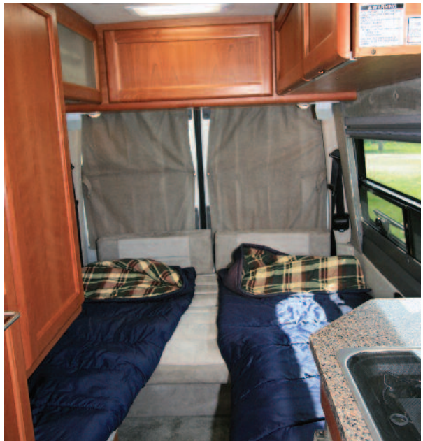
Sleeping accommodations can be made into a king-size bed or twins (shown), when the center cushions and support are removed.

During the heat of the day, 11,000 BTUs of