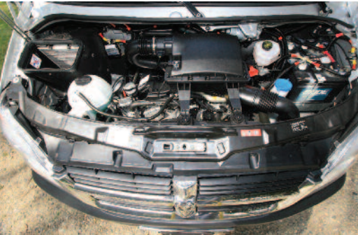
Powered by a 3.0-liter V6 turbodiesel, the SS-Agile averaged 21 MPG on the highway.

Regardless of what you call it, with a very long list of standard features, and built on an innovative, economical chassis, the new Roadtrek continues to offer proven Class-B mini-coach versatility and agility that has created a legion of loyal enthusiasts and repeat buyers.