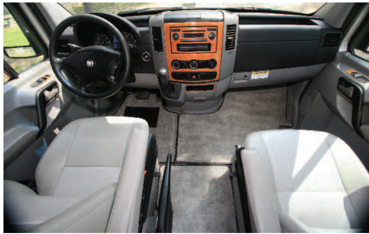
The easy-to-drive SS-Agile offered a roomy and well-appointed cockpit.