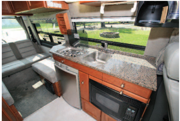
A 3.8-cubic-foot three-way-power fridge and a 1-cubic-foot convection/microwave oven highlight the luxurious and well-designed kitchen.

cooling breeze from the rooftop AC unit will be welcome relief while connected to camp power. Or at the push of a button, you can energize the optional ($2860) 2.5 kW propane generator behind the rear axle to power the cooler.